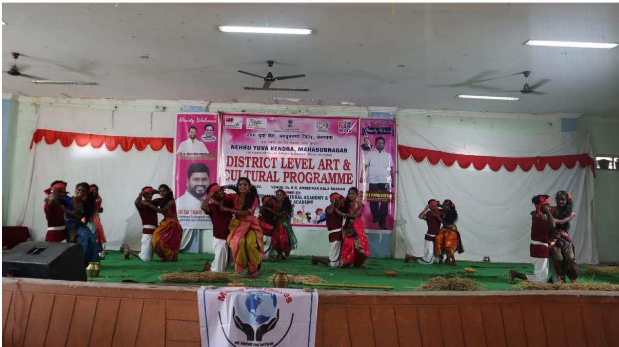
Ambedkar Bhavan Days