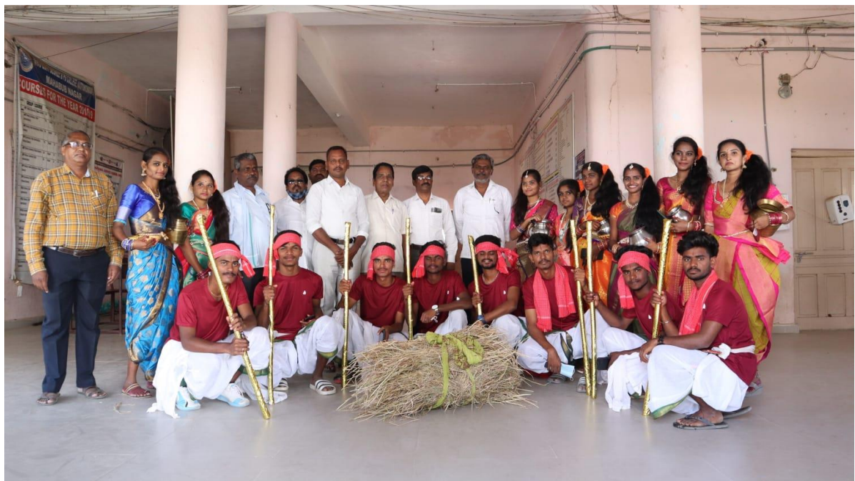
Students Photo with Principal & Staff