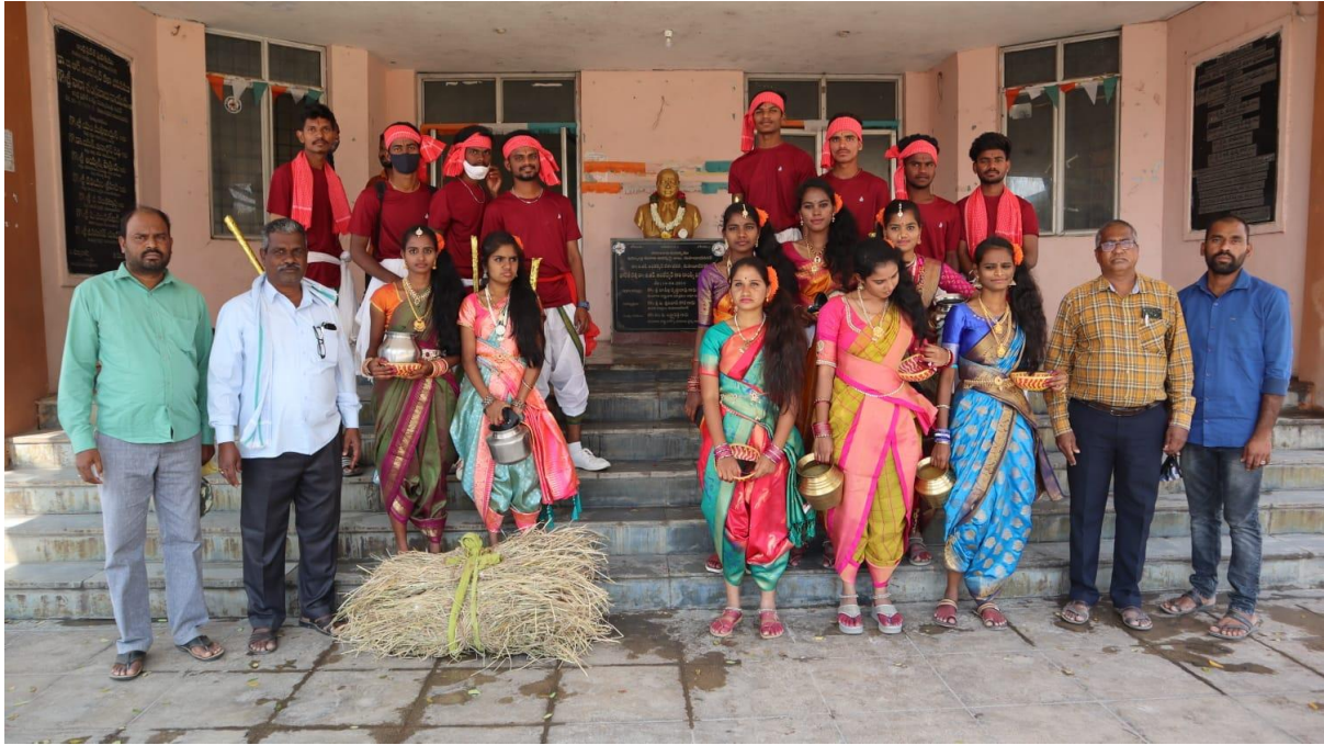
Ambedkar Bhavana Dwaaramu