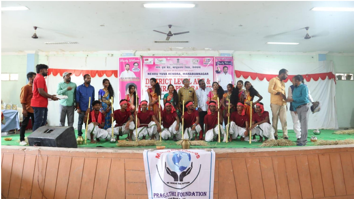
Students Group Photo Auditorium